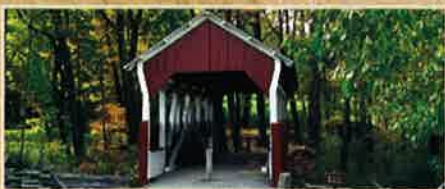
WALTER'S MILL COVERED BRIDGE, 1859