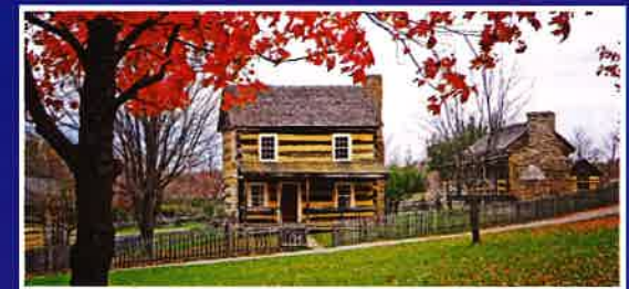
ADAM MILLER HOMESTEAD