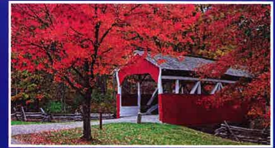
WALTER'S MILL COVERED BRIDGE, 1859

Our visitors come back year after year. If you've never visited Mountain Craft Days, come see what you've been missing.